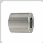
Art.-Nr. 196394 Welding socket

When the sensor is mounted with our adapters: welding socket or the process adapter Varivent N DN 50 a hygienic, EHEDG conforming process connection will be achieved.