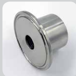
Art.-Nr. 190754 Tri-Clamp