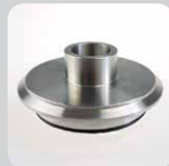
Art.-Nr. 196395 Varivent N DN 50