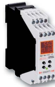
Multifunction timer MK 7830N