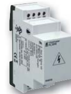
Coupling device RL 5898