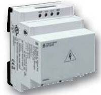
Coupling device RP 5898