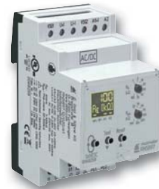
Insulation monitor RN 5897/020