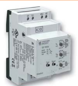
Insulation monitor RN 5897/300