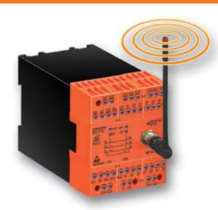
Wireless safety module BI 5910

Safety Integrity Level (SIL 3) in accordance with IEC/EN 61508