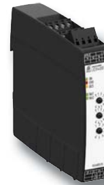
Multifunction measuring relay UG 9400