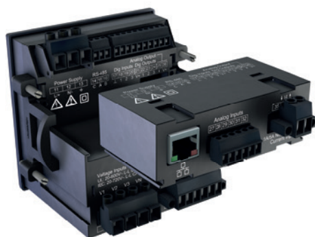
Module UMG 96-PA-RCM-EL