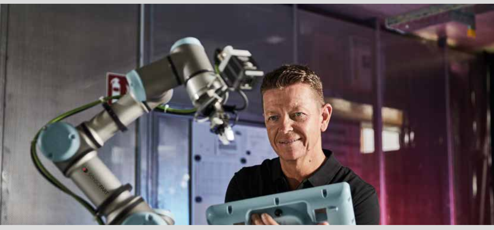
Easy setup of robotics applications using the operating panel

For a seamless connection between Vision sensor and robot.