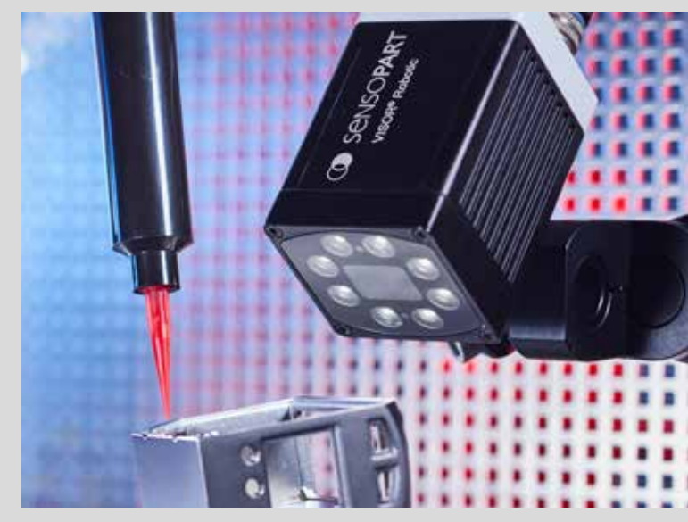
The VISOR® Robotic determines the exact position of the sensor housing. Offset data is used to correct the robot's trajectory.

VISOR<sup>®</sup> calibration plate: automatic correction of errors caused by distortion ensures precise results. Four available versions cover diverse fields of view and working distances.