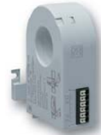
Residual current transformer ND 5015