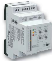
Residual current monitor RN 5883